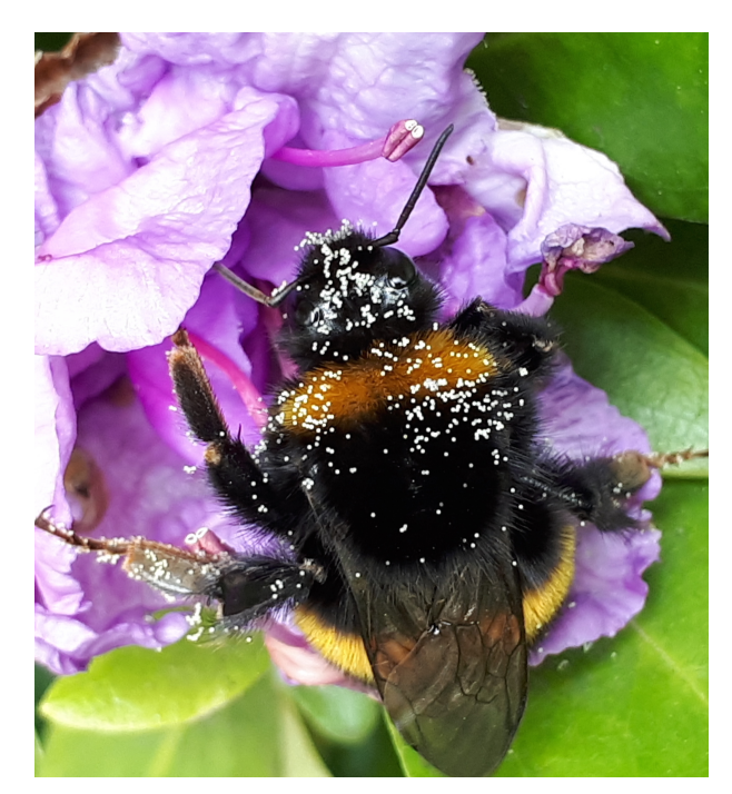
Bumblebee covered in pollen.

EFB and AFB are infectious bacterial diseases and none of us can afford to be complacent. Some good beekeepers have been caught up in this outbreak so we are all going to have to raise our game and we must not