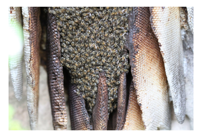
A wild bee colony in South Africa. Source: Ujubee's Facebook page.

have taken a leaf (pun not (originally) intended!) out of the tobacco industry's book, was one of the most compelling for me.