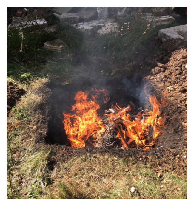
Look at this photograph. It shows how infected equipment has to be destroyed – a fire pit 1m \times 1m \times 0.5m . Ask yourself the question, "where would I have a fire like that?". If you have an out-apiary, ask yourself, "how is my host going to feel about this?"

The issues raised by this summer's outbreaks do not stop at best practice to reduce the risk of pests and