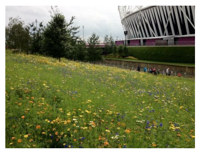
"Going for gold" planting during the 2012 games.

for the Olympic park to reflect the national desire to achieve gold, not just in the sporting activities but in setting the gold standard for the most environmentally sustainable Olympics ever held.