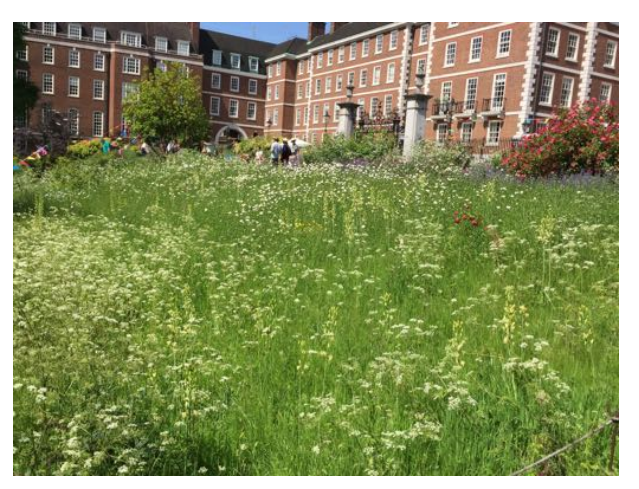
The urban meadow at Inner Temple Gardens

Like annual mixtures, meadows can be quick to establish and usually at low cost. Again, ground preparation is critical. There are 3 main methods of establishing a meadow. The first is to simply cease cutting the grass as frequently allowing plants to naturally colonise. This can take a long time and look unsightly and unmanaged. In London Borough of Wandsworth new acid grassland meadows have been created by simply removing the upper inches of soil and existing grass turf to expose the seed bank beneath and allowing natural colonisation and succession to take place. The result is that, on Tooting and Wandsworth Commons, blankets of white Clover, Birds Foot Trefoil, Scabious, Knapweed, Hawks beads and Red Bartsia now flourish. The Council has saved considerable funds by only cutting the grasslands once per year and, aside from the ini-