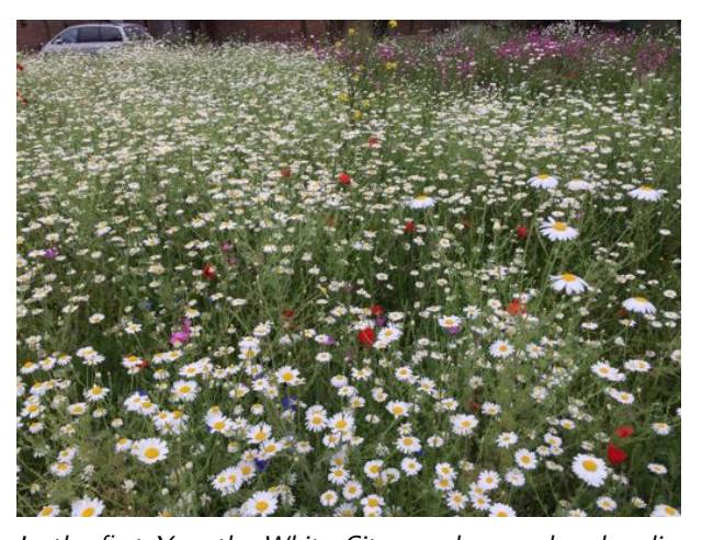
In the first Year the White City meadow produced a display including field /emphpoppy, cornflower, corn cockle, corn chamomile, field marigold before the campions, scabious, Knapweeds and Oxe-eye Daisy took over in subsequent years.

Whilst its generally true that perennial plants produce more pollen and nectar, some flower earlier in the season than annuals and are better at attracting and supporting long term populations of bees which form large nesting aggregations. Many of the annual species included in these mixes are also among the top most attractive plants to bees. Borage, for instance, frequently comes out as the number one best plant for Honey Bees, Phacelia is among the best annuals for Bumblebees. Field Poppy has a very high protein content in its pollen and is very useful to Honey and Bumblebees. Annuals like Corn Flower, forget-me-not and Poached Egg plant are highly attractive to a wide range of bees. The humble Pot Marigold often found in these mixes is