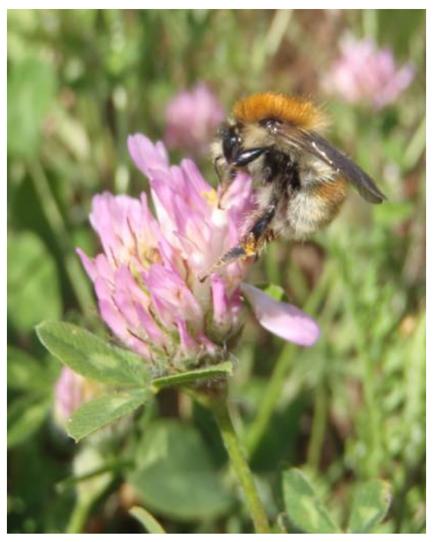
A Brown Banded Carder bee.

me that some of the best sites for these rare and critically threatened bees are former brownfield sites like the Olympic Park. These bees need a rough sward including rank grassy areas and an abundance and diverse range of flowers to support their populations throughout the late spring to late summer. Most flowering trees and shrubs are spring flowering and offer nothing to support these summer flying pollinators.