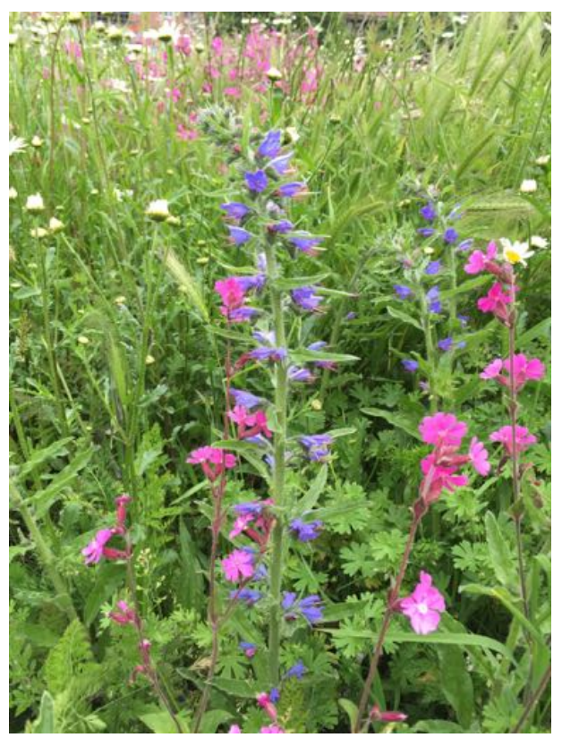
Vipers Bugloss flowering in the White City Meadow behind Television Centre.