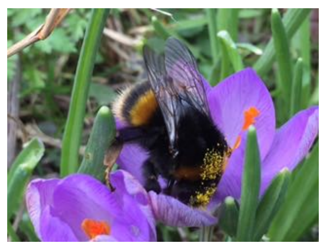
Buff tailed queen on crocus.