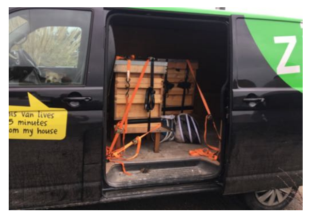
You don't want bees flying around the back of a van. You don't want bees flying around the back of a van.