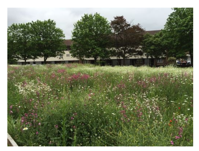
An inexpensive native meadow I created in 2014 behind Television Centre in White City, West London. This meadow was sown from seed using a bespoke seed blend which I designed. The mix had a higher than normal percentage of wild flowers to grasses as residents wanted a colourful display. Over 30 species including 12 annuals and biennials to provide interest in the initial 2 years were succeeded by 23 perennials and 11 fine native grasses.