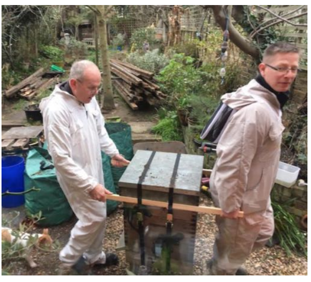
Testing the prototype hive carrier promised in the risk assessment. We rejected a proprietary one on the grounds of poor design and poor welding quality. The handles shown here cost considerably less than £55!

The roof-top apiary at Holland Park was beautiful but, to be honest, it had never worked as a teaching apiary as we hoped because we had to limit the number of people on it to comply with the safety loading of the old structure. The new site not only has no such re-