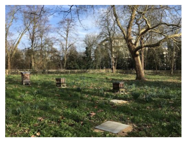
Yes, central London.