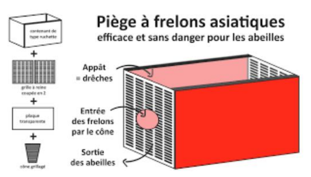
Mary Walwyn found this Asian Hornet trap designed by Jean-Pierre Thomain which tries to at least partially address the problem of traps catching other beneficial insects. The box has queen excluders fitted at each end, so other bees and insects can escape. The hornet enters via the cone firmly set in excluders so hornet cannot exit out again. It has a clear perspex top that is well secured. It is baited with honey in spring and the hornets that are caught can be put in the freezer or in a tank of water to kill.

measure up to 4cm and was feared extinct. A single female was rediscovered on the Indonesian islands of the North Moluccas, living inside a termites' nest. MAP also uploaded two helpful documents, anyone keeping bees on land owned by someone else will find the Beekeeping agreement useful. The Risk Assesment template – used by the LBKA at all our apiaries – will be useful to anyone keeping bees on or near to public land.