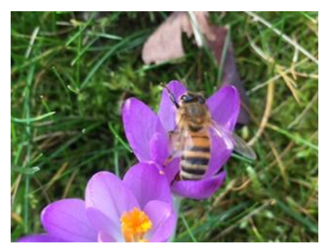
Honey bee on crocus.

blooms become frosted resulting in a neat looking shrub without the tainted frost damaged petals which can look unsightly.