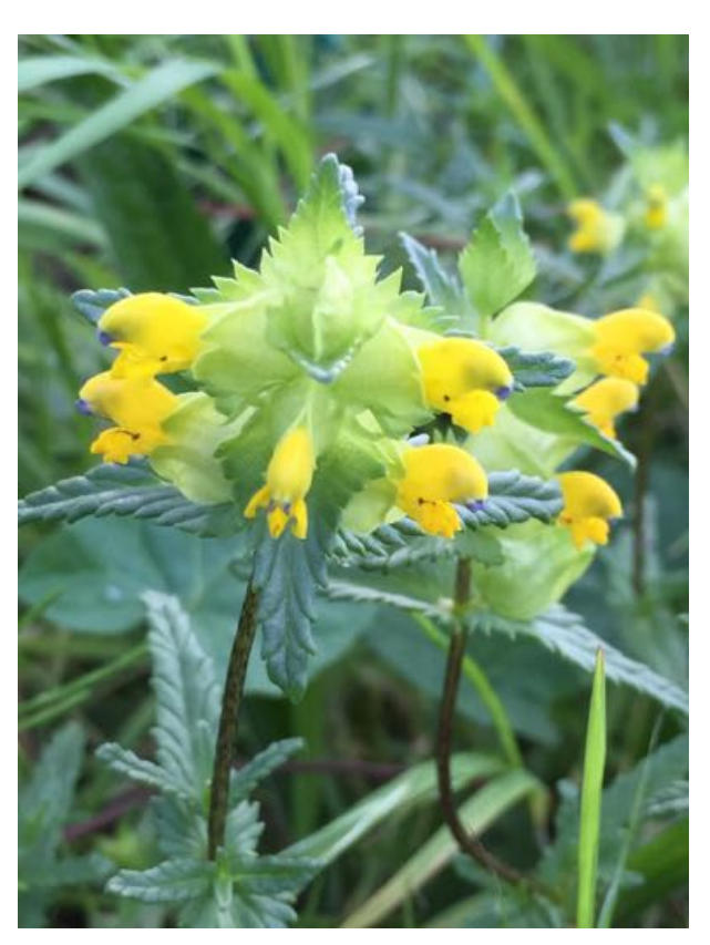
Yellow Rattle – a hemiparasite of course grasses. Here seen growing among a small meadow on a social housing estate in Acton, West London. This is a useful species to include in plug planted meadows as the plant weakens the grasses allowing the wild flowers to compete for space and flourish. It is also a fantastic plant for bumblebees.

When creating native meadows it is important to manage the expectations of the public. I've often come across scenarios where Councils or housing estate managers have consulted the community about replacing regularly mown grassed areas with meadows and, during the consultation, colourful informal annual mixes or mixed planting schemes like those of the Olympic Park have been shown. This misrepresentation will un-