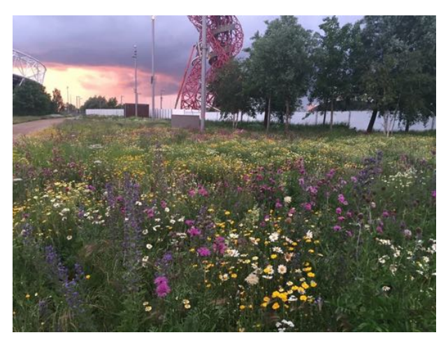
Fabulously extravagant perennial meadows at the Olympic Park in Stratford! A haven for bees and other pollinators.