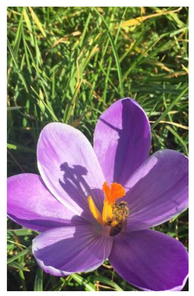
Bee on crocus.

But of course, weather – the local, time-based expression of climate – never has been an easy thing to fore-