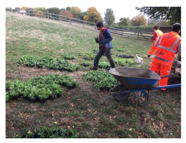
Corporate volunteers from Cross Rail assisting the London Beekeepers Association to plug plant a native meadow on the Isle of Dogs near Canary Wharf. This meadow habitat is home to a UK BAP priority bee species and 3 Local BAP bees species which this meadow will support.

m2 in area and cost less than £500 to create (including removal of turf, cultivating the soil, purchase of a bespoke designed seed mix and sowing). They cost less than £100 per year to maintain where before the regular grass cutting was more than double this. In the long term these meadows bring cost savings to the local authority. Meadows on larger scales cost even less as there is a reduced cost associated with travel time, Machine maintenance and larger areas can use larger machines which work faster. Whilst there is often some additional cost of maintenance of the cutting blades associated with cutting longer grass in meadows this can be reduced or even offset by investing in better quality blades, adjusting the cutting height of the blades and the speed at which it is cut.