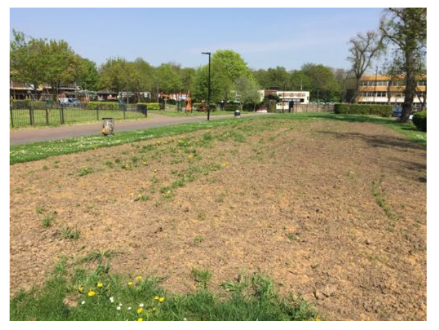
Creating an urban meadow in Ealing. March 2018 and ground has been cleared ready to sow a new native meadow on the Windmill Park Estate. This area needed further weeding prior to sowing because the contractor failed to follow the specification I wrote and did not remove all the Dandelions and other course perennial weeds.

tial soil and turf removal, has not had any input into the meadows. The net cost was zero compared to a business-as-usual mowing regime.