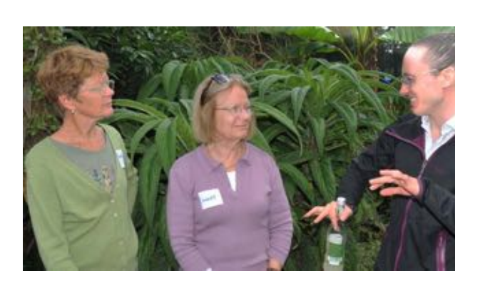
Clearing up. Thanks to all those who helped