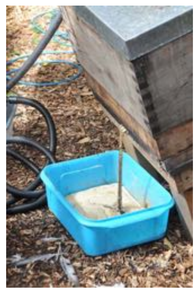
Extracting wax from a hive by pumping steam into it.

Many thanks to all who contributed to making this event a success.