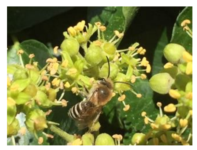
Ivy bee on ivy blooms.