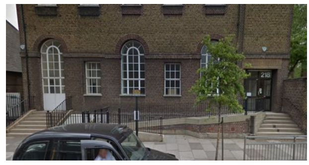
The venue for our monthly meeting – the white door on the left

afterwards. If anyone would like to bring some cake, I'm sure that would go down well.