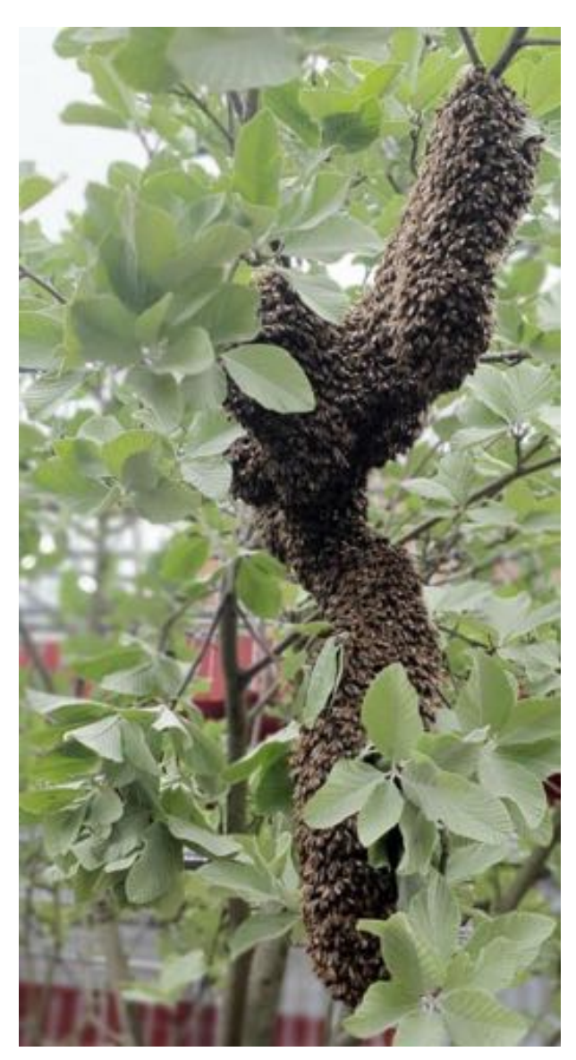
Swarm in North London.

Anyone who has kept bees even once at this time of year knows that timing is everything: inspect for swarm preparation every 7 days or you will miss it and at least half of your bees will be gone. That can be a challenge in our busy lives – we thought. But it turns out to be an even greater challenge in, for many of us, our not-so-busy lives of lockdown where yesterday was Monday and tomorrow is Friday. It's a small price to pay and I hope our members are taking care of themselves