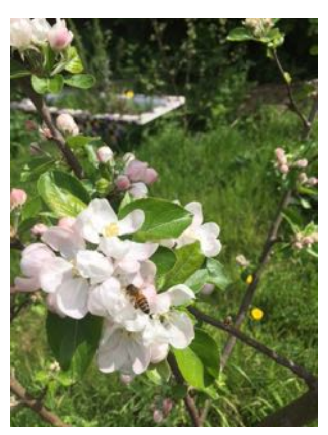
Honey bees visiting my apples.

Herbaceous perennial plants important to bees this month include Dandelions which are coming to the end of their main flowering period in London, Green Alka net (pictured; now at its peak), Forget-me-nots and Spanish Blue bells with their green-blue pollen.