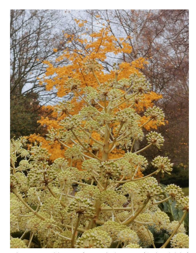
The Autumnal leaves of a Maidenhair tree (Ginkgo biloba) behind a flowering Paperplant (Fatsia japonica) in Hornsey's Priory Park. Late season forage. Photo/caption: Eugene McConville.

Whilst Covid constraints on face to face meetings are undoubtedly a great loss, there have been some positive outcomes, firstly by prompting a rethink on just about