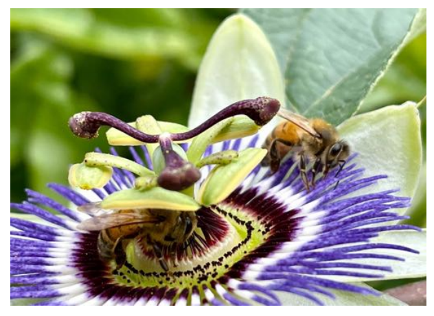
Spotted by Eugene: Bee on passion flower. "The long and short of it". Photo and quote: Eugene McConville.

if you could come back to me on if this is something you would be happy to be involved in."