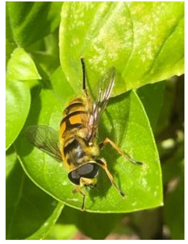
Spotted by George: "Beautiful hover fly resting on a fragrant wide basil leaf". Photo and quote: George Kozobolis.

the stores. Any surplus will not be wasted as it will be used by the bees next spring.