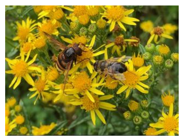
Spotted by George: "TA few days ago I witnessed a hornet mimic (Volucella zonaria) and a wild bee foraging happily very close together on a (Jacobaea Paludosa) wild flower". Photo and quote: George Kozobolis.