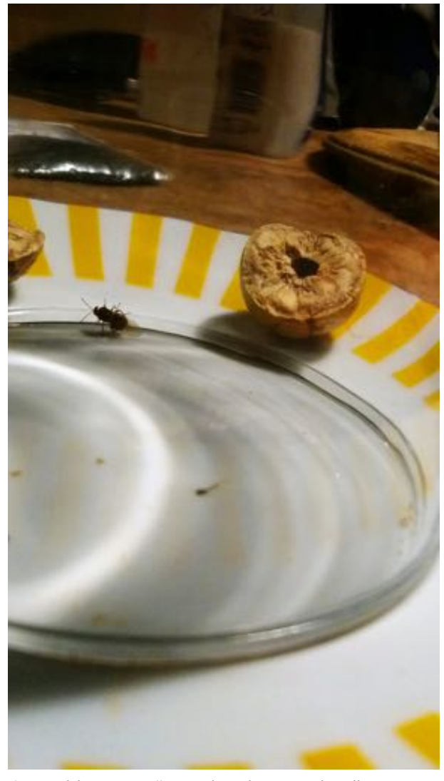
Spotted by Janet: "Not a bee, but an oak gall wasp. We opened up the oak apple expecting to see a grub and this came out". Photo and quote: Janet Evans.

We're looking for members to summarise the issues discussed in a digestible way. Please contact services@lbka.org.uk if you may be able to help in some months.