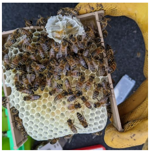
A mated queen on a frame of a miniature mating nuc. Note the pink larvae in the frame indicating that the queen is laying.

You can practice grafting dozens of larvae on bars that you never intend to put into a hive. Then when you are ready to do the grafting for real, you can move quickly and accurately. I prefer to lay the frame of eggs on a table in front of me with the top of the bar facing towards me. This makes it easier to look down into the cells. I hold a torch in one hand and a grafting tool in the other. If I mishandle a larva in any way, either in