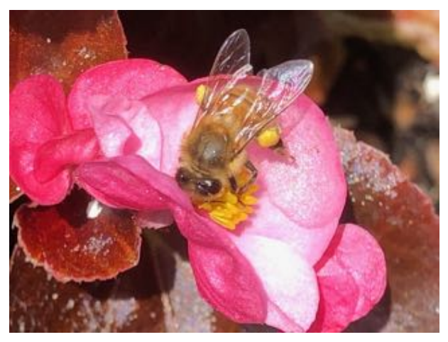
Spotted by George: "Loaded with pollen this honeybee is busy sucking up nectar from a pink begonia flower". Photo and quote: George Kozobolis.

We need to help run our social media. If you are good at communicating with social media, then we need your help. Our social media channels already have an impressive reach, but we aren't using them very proactively to manage our communications. This is a good opportunity to help develop a profile of a local charity and its charitable objectives. Please contact