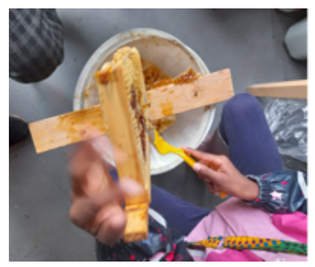
Future beekeepers skillfully uncap super frames for the Brockwell Park apiary

ers. As it happens, taking off the honey coincides with school holidays and I visited the Brockwell Park teaching apiary to see how the honey extraction was getting on, as many children and their carers had signed up to help with this momentous event.