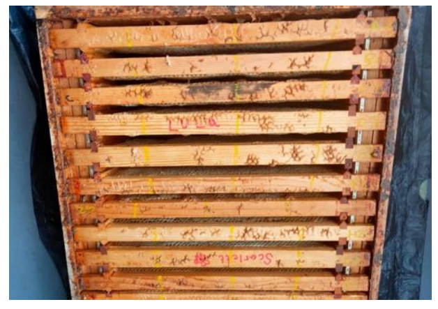
Children proudly sign their uncapped frames at Brockwell Park apiary.