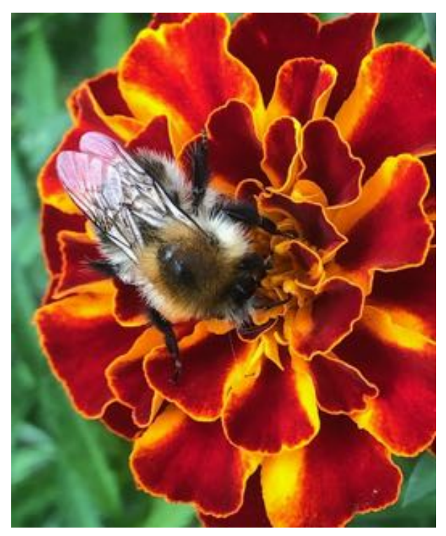
Spotted by George: "Wild bee collecting fragrant nectar from a beautiful marigold.". Photo and quote: George Kozobolis.