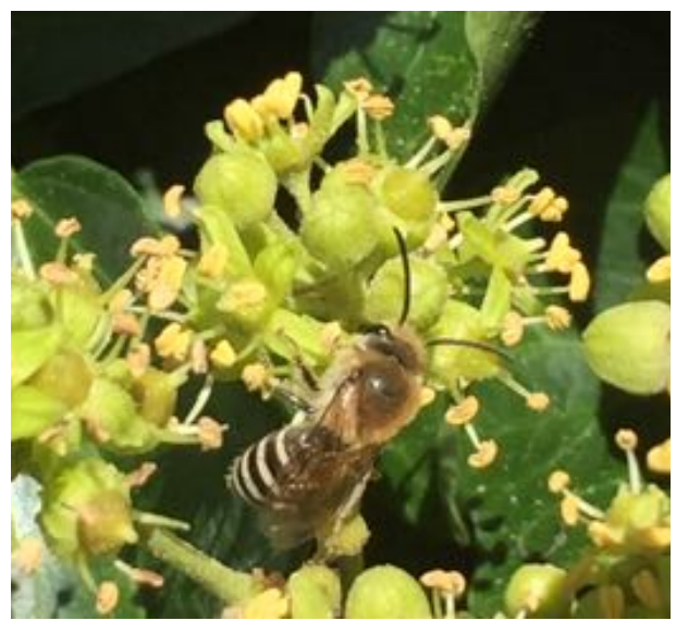
Ivy bee on ivy blooms.