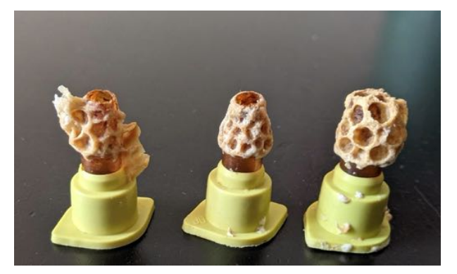
Queens cells after a queen successfully emerged.