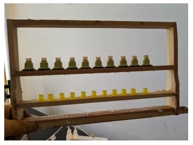
A graft frame with two different styles of graft cups.

Queen rearing by grafting is often viewed as an advanced skill, and is therefore never attempted by most beekeepers. Many perceive it as too difficult, or requiring too much time or resources. Below I share some of my observations and experiences rearing queens in my second and third year of keeping bees, using only a six frame nuc in my garden.