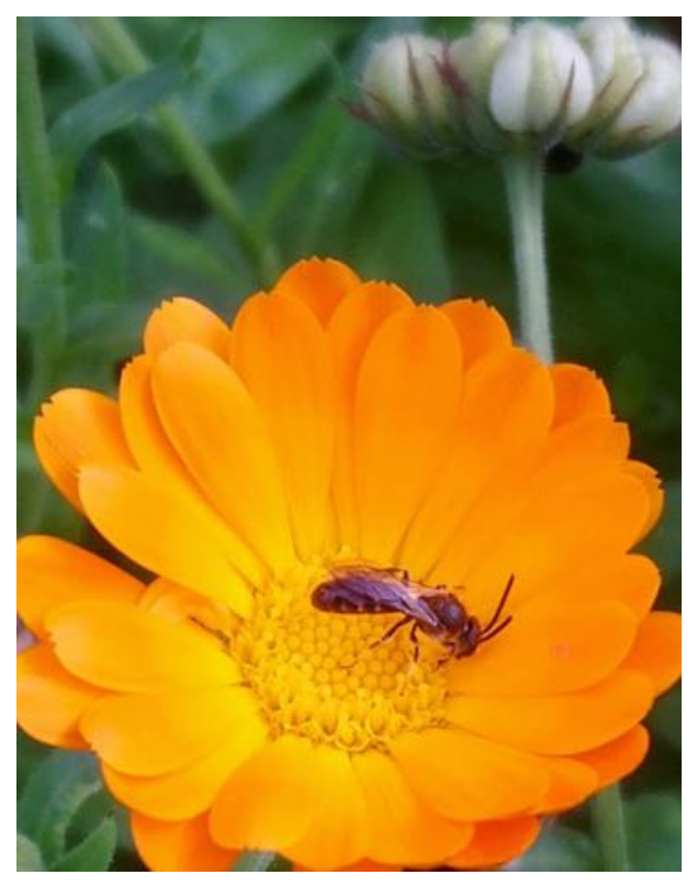
Lasioglossum bee on marigold in Janet's allotment.