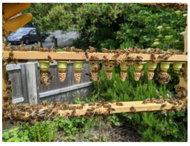
9 cells ready to place into nucs.