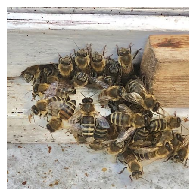
Spotted by George: "For some time lately, I have noticed unusual behaviour in one out of our three hives. Whilst the bees of the other two hives are very busy going in and out, in this particular hive very few bees will fly out for foraging and a substantial bunch of them spend all day loitering by the entrance (which is now reduced to eliminate wasp attacks). Strangely enough they perform little front and back body movements and appear to be chewing on to something but there is no sign of that on the wooden entrance. If it was springtime, I would have assumed that there was congestion in the hive and they were making preparations to swarm. However, it is October now and the colony is not overcrowded! I wonder if anybody has ever observed something similar and has a reasonable explanation for this strange/unusual behaviour". Photo and quote: George Kozobolis.