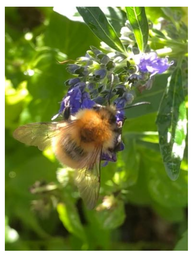
Spotted by George: "Despite the strong windy day (making it very difficult to take a sharp photograph), a wild bee ventures out hanging on for dear life collecting its load of nectar from a Caryopteris clandonensis (Heavenly Blue - Bluebeard) beautiful blue flower". Photo and quote: George Kozobolis.

very proactively to manage our communications. This is a good opportunity to help develop a profile of a local charity and its charitable objectives. Please contact Simon Saville at development@lbka.org.uk to find out more.