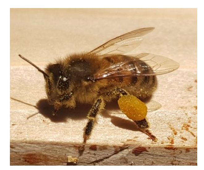
Spotted by Will. "Back to work. She was just having a bit of a clean up in the sunshine outside the hive before dropping off all that pollen. So nice to see the winter bees all furry and getting out and about!". Photo and caption: Will Bunker.

In the period leading up to the ADM I wasn't sure if BBKA members were ready for that position. But when the proposal came up I did rather casually point out on the delegate Chat that environmental sustainability was probably closer to beekeeping than climate change. Live chat amongst multiple participants can move very fast and be very confusing and so it was on