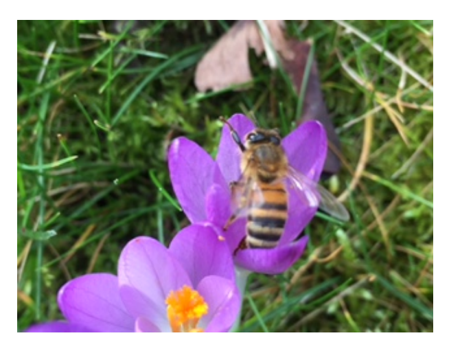
Honey bee on crocus.

cus varieties are just starting to join the display too. These and other spring bulbous plants include Winter Aconite, Anenemone blanda, Squill and Muscari. These are valuable early sources of pollen for bees.