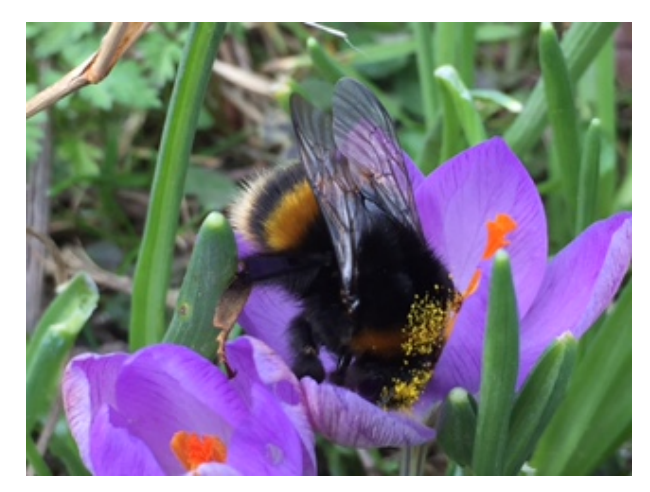
Buff tailed queen on crocus.