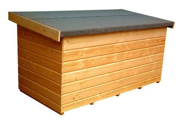
Shed that we're giving away.

work Agreement, but be managed and paid directly by SFM.