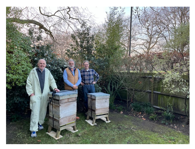
Our new Hyde Park Apiary.

March in the Apiary LBKA News, March 2023