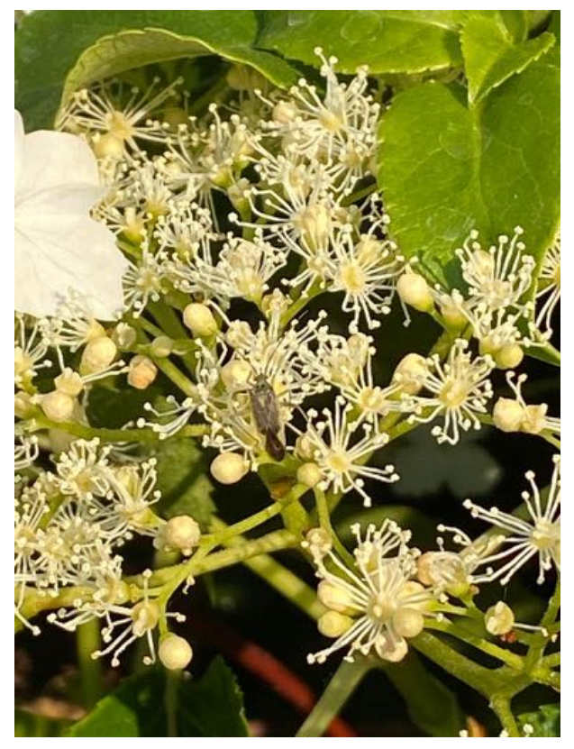
Spotted by Lucie.