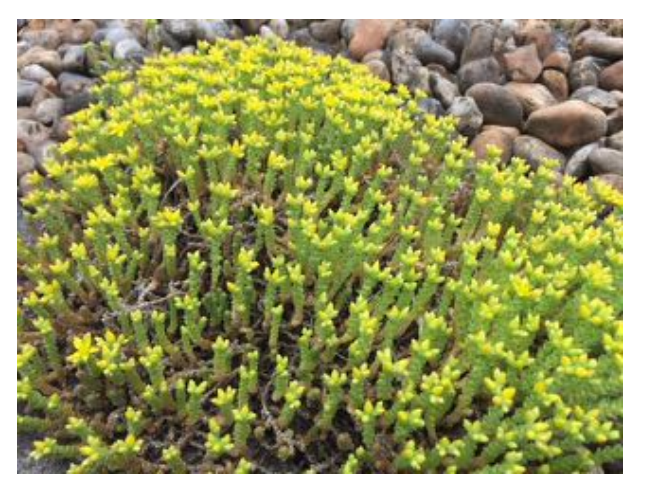
Sedums blooming on a roof top in Chancery Lane.

but the summer flowers are yet to peak can leave large colonies struggling to feed themselves or to fill supers with surplus honey for the beekeeper.