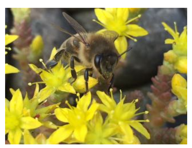
Honey bee on sedum ocre

Urban areas contain many exotic trees which flower after our native species have ceased flowering. These include sweet chestnut , pseudo acacia , and Tree of Heaven . Along railway embankments, fire weed , this tles and teasel are also blooming.