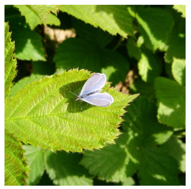
Spotted by Janet. "I think it is a common blue butterfly, it's on blackberry at the allotment.". Photo and quote: Janet Evans.

gate/educate them for pollarding their Lime trees 3 weeks before they were due to flower.