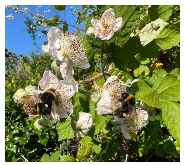
Spotted by Vane. Bumblebees on bramble.

cial swarm (the box with the old queen) to see whether it is producing further queen cells.