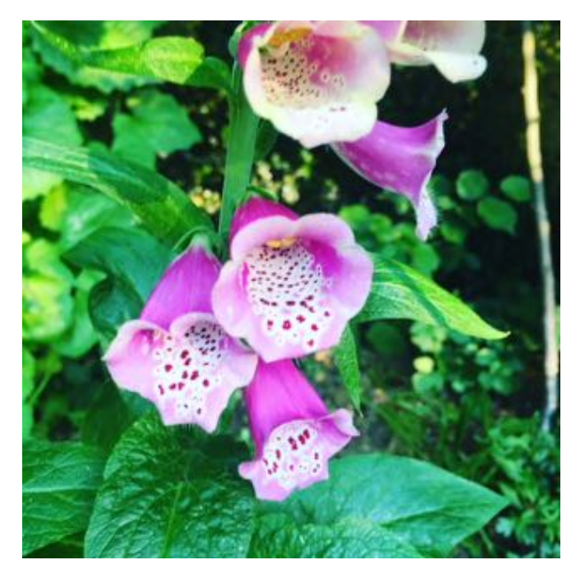
Foxgloves are out now.