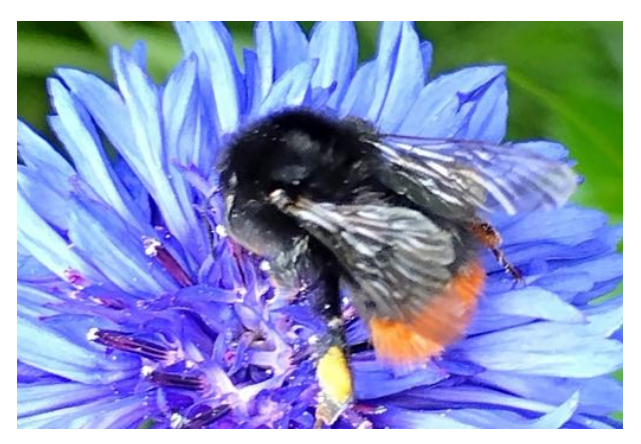
Red-tailed bumblebee.