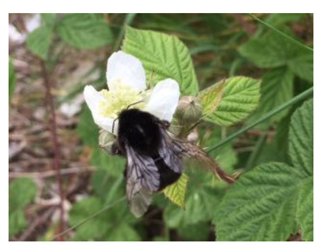
Red tailed bumblebee on bramble blossom.

At this time of year honey bee colonies are approaching their peak in worker population in readiness for the summer flow, queens are laying at a prolific rate and colonies have many larvae to feed. A reduction of incoming nectar and pollen as the spring flowers cease