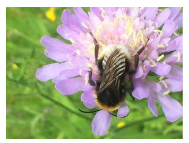
A bumblebee on field scabious.

city centre bees include pyracantha (fire thorn) co- toneaster and ceonothus which are often grown as amenity shrubbery, the blooms of which provide much needed pollen and nectar.