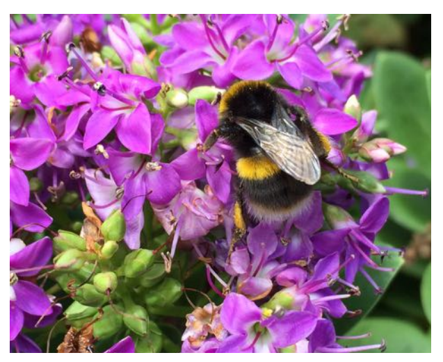
Hebe great ornamental flowers July to September.