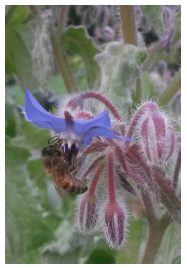
Honey bee on borage.

Our organisation has been growing and changing since I first joined nearly 9 years ago but our change to charitable status seems to have coincided with and helped