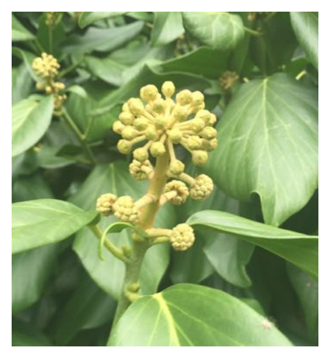
Ivy flowers almost ready to open.