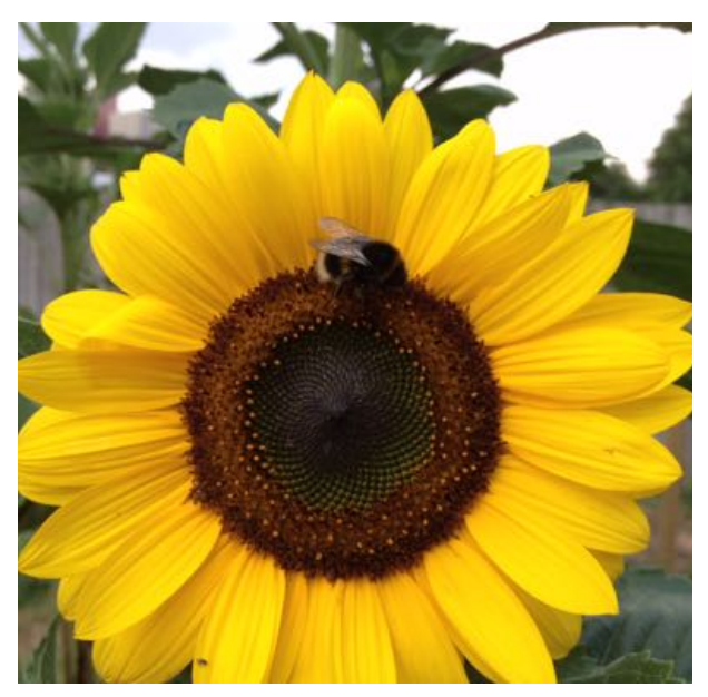
Sunflowers offer copious amounts of nectar on warm days.