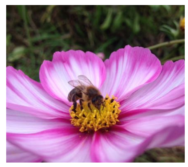
Honey bee visits a Cosmos flower.