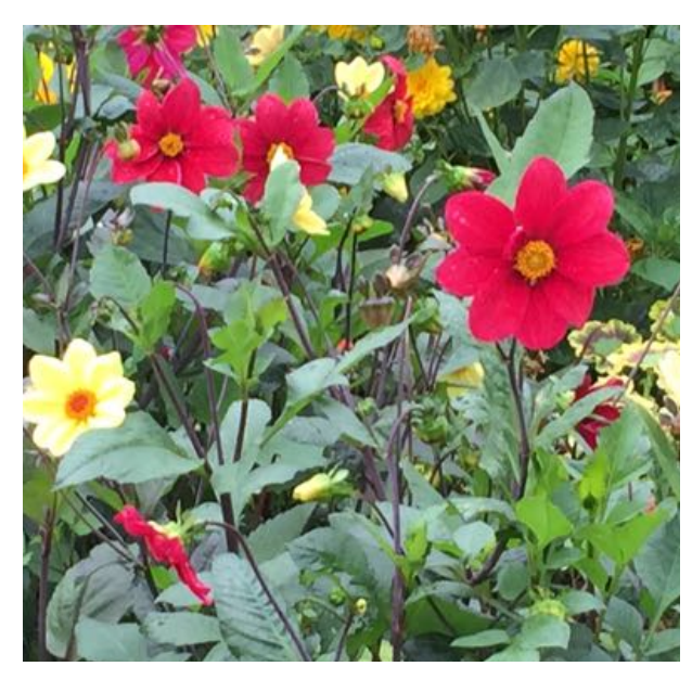
Dahlias provide bright yellow/orange pollen.

ering but a few persist. Asters, Field Scabious, Purple Loosestrife, Water Mint, Mallows and Purple Hoarhound continue to flower. On disturbed ground and brownfield sites yellow toadflax and willow herbs and bindweed are also persisting.