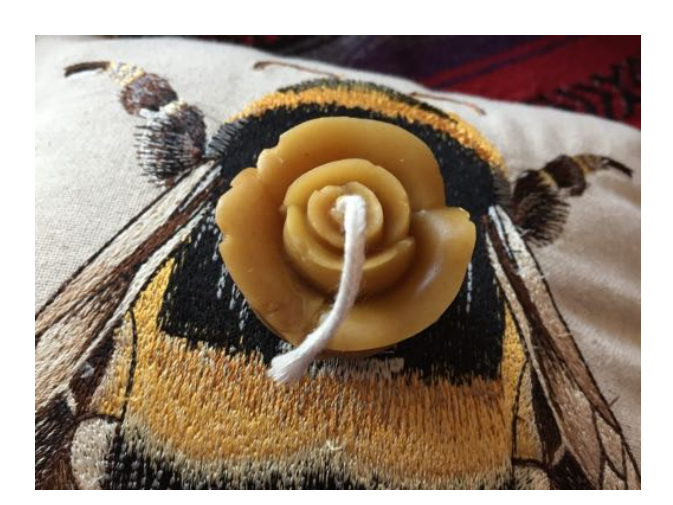
only, but you're welcome to come as a guest to find out more about our association.