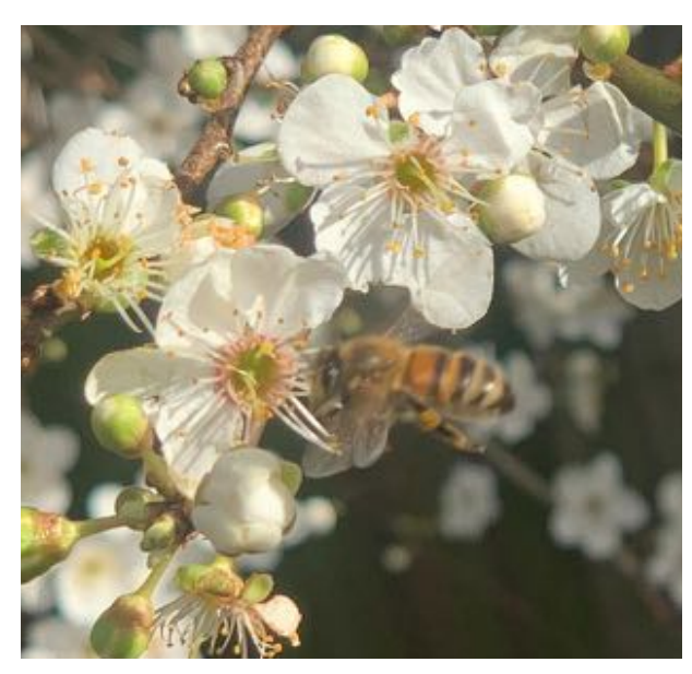
Spotted by Giovanni: Sign of spring. . . Photo and caption: Giovanni Selvaticus.

To be fair, there is no question of blame here but it is frustrating to say the least to fall foul of the reaction against honey bees when we are probably doing more than anybody to raise awareness of the London Bee Situation and we had such high hopes for Holland