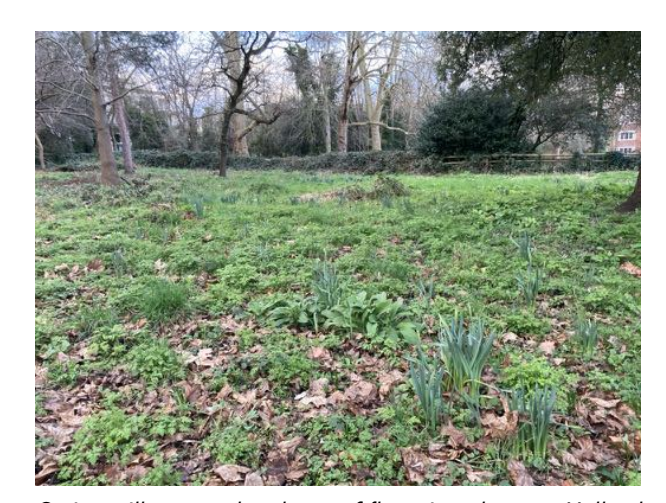
Spring will see an abundance of flowering plants at Holland Park