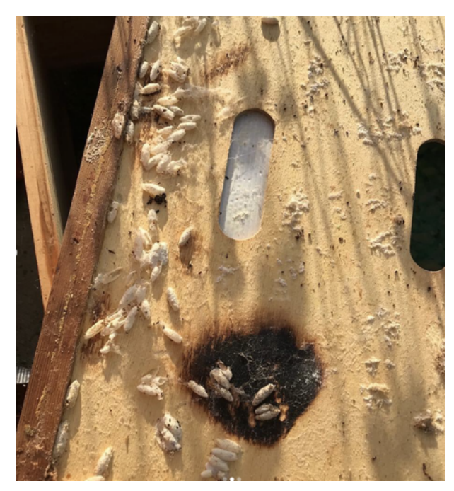
Instagram post: Waxmoth moved into this hive after the colony died and the hive couldn't be removed or sealed for several years. The larva have devoured the beeswax inside, and are now pupating inside white cocoons.

Any LBKA member who has been managing bees for a