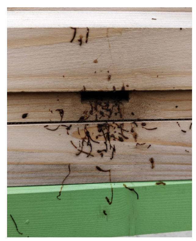
Instagram post: Faecal deposits such as this are a often a sign of nosema.

Check our previous newsletters or contact services@lbka.org.uk for more details.