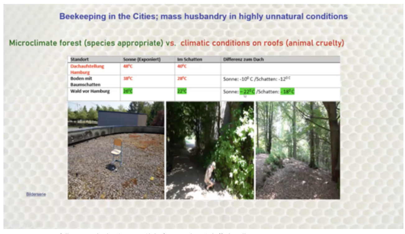
Temperatures in full sun vs shade.

a stable humidity in a tree cavity, compared to a thin box.