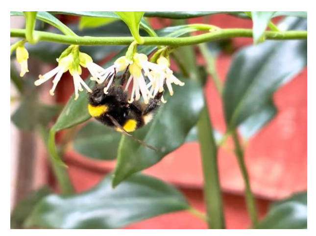
Spotted by Eugene: 5° C and there's two bumblebees on this plant. Photo and caption: Eugene McConville.

then it is better not to feed at all so not to cause any disturbance.