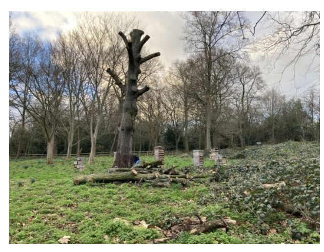
Good news for stag beetles at Holland Park