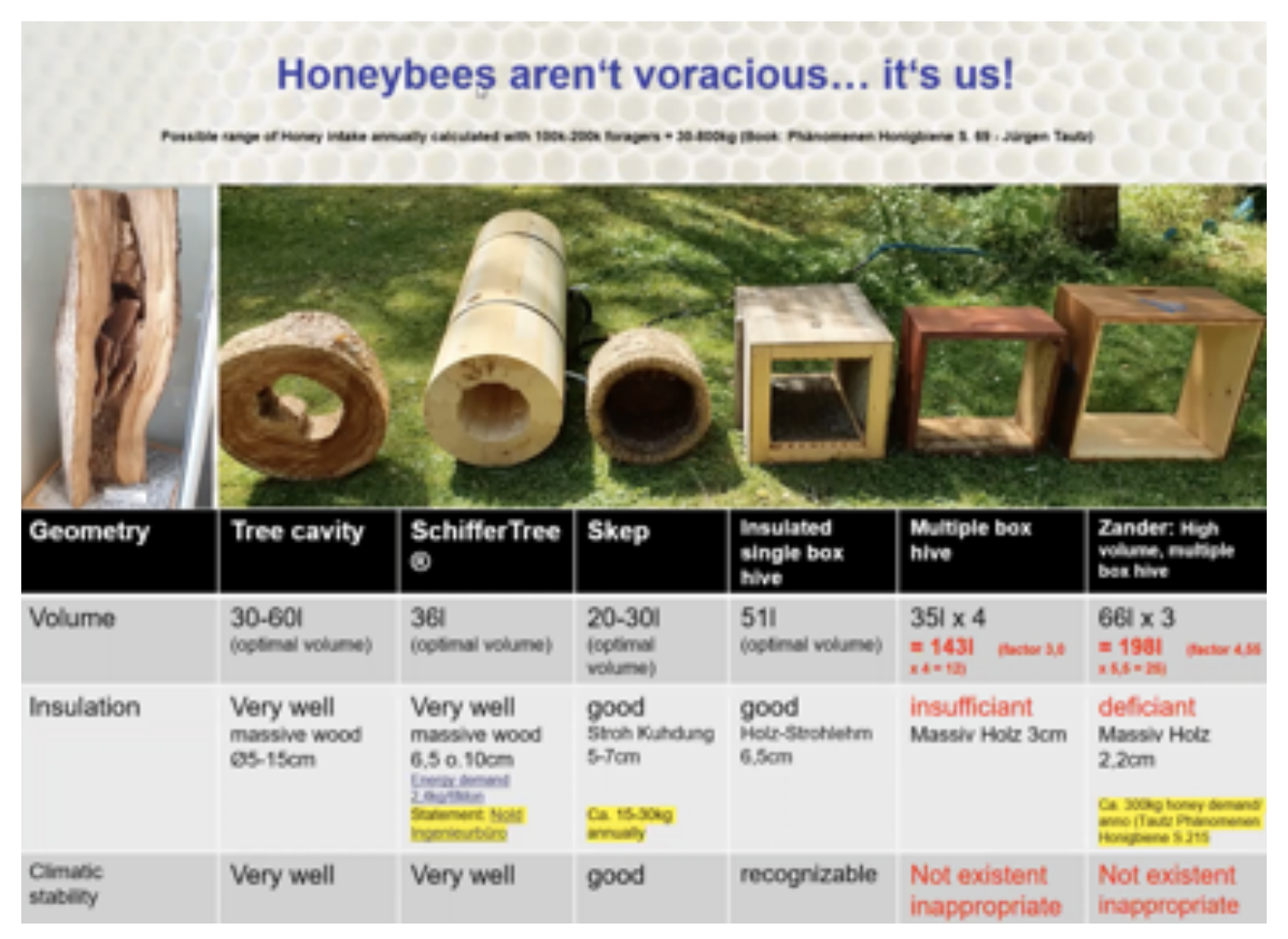
Table of hives with volumes, Insulation qualities and climatic variations of different types of bees nests.

bees in this area is one colony per square kilometre. He reported that the density in Hamburg, where he works, is 17.3 colonies per sq/km, and in Berlin on average 17 colonies per sq/km, and up to 23 colonies in some locations.