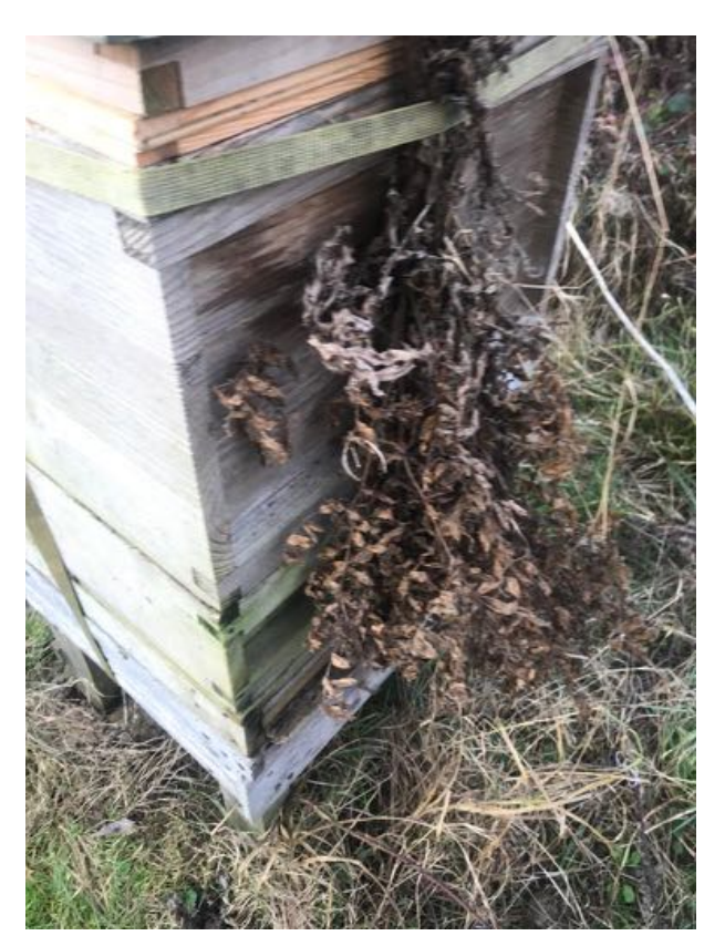
Spotted by Geoff: Two other hives were moved within the apiary. so dead vegetation was used over the entrance to make them reorientate.

February is a time of increasing activity for the bees.