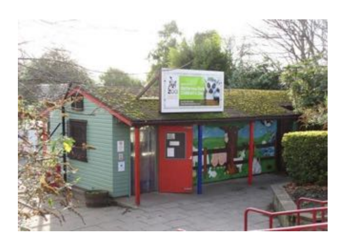
Battersea Children's Zoo.

tified, and how some honey bee populations in Brazil and parts of Africa, USA and UK all appear to have evolved similar ways to combat the Varroa mite.